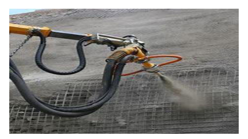
Fig No 3.0 Shotcreting

Next up, we spray concrete onto the inflated membrane. But this isn't just your average concrete mix specially made to be super strong. As we spray the concrete starts to pile up, forming a thick layer over the membrane and taking on its shape. We've got to give the concrete some time to set and harden. This is called curing, and it's where the magic really happens. Just like waiting for cake batter to turn into a yummy cake in the oven we've got to be patient while the concrete becomes solid and sturdy. Once the concrete is good and solid it's time to get rid of the membrane. This is where things get really cool. We deflate the inflated membrane and take it away leaving behind the concrete shell. And because the concrete has hardened it holds its shape all on its own no need for the membrane anymore.