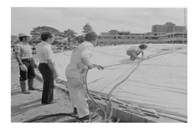
Fig No 2.0 Fabric Or Polymer Flexible Membrane

Think of blowing up a balloon. That's how Binishells kick off. We start with a big, flexible membrane made of tough fabric or polymer. Then we pump it full of air to create a kind of temporary mold that's shaped like the building we want.