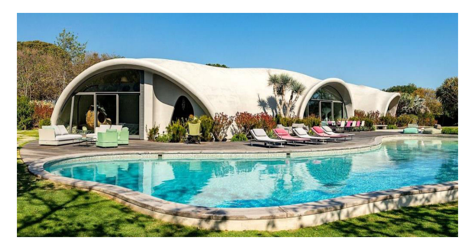
Fig No 1.0 Binishell,Nicolo Bini,2009,Los Angeles

Binishell construction is like a beacon of human creativity and innovation in the world of sustainable architecture. Imagine this back in the 1960s architect Dr. Dante Bini had this wild idea that shook up the way we build things. He came up with the Binishell method, a total game-changer in construction that flips traditional techniques on their head. Binishell construction uses air-supported membranes to shape concrete into strong shell structures. It's kind of like blowing up a balloon, spraying concrete on it and letting it harden into a solid shell. Once the concrete sets you deflate the balloon like membrane and voila You are left with a sturdy building with that signature curved shape.