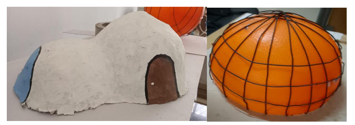
Fig No 6.0 Mini Binishell Model