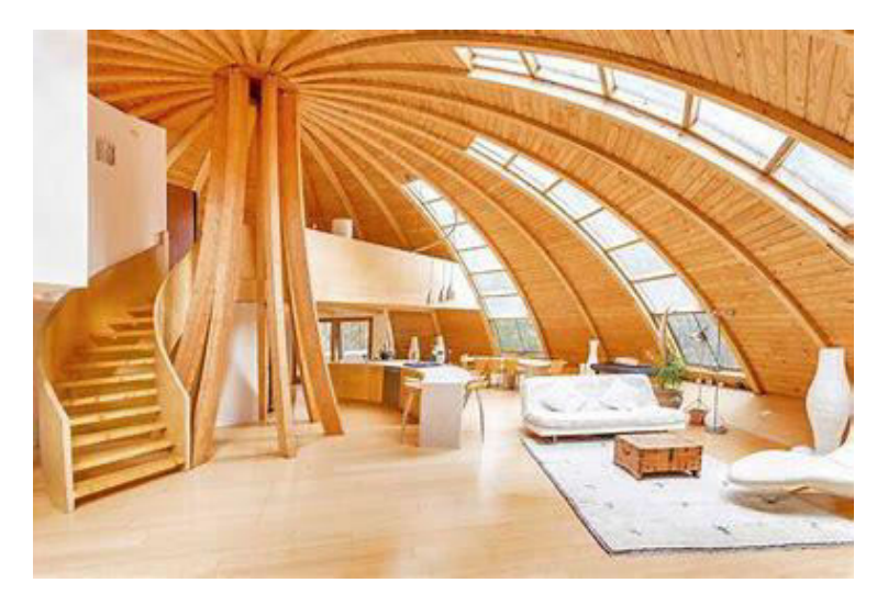
Fig No 4.0 Furnish Binishell

Binishell construction offers numerous advantages over conventional methods. It's notably cost effective due to reduced labor, materials, and time requirements leading to significant cost savings. Its speed of construction is more then traditional methods by the inflatable formwork which allows for rapid assembly and shaping of structures. Binishell structures boost energy efficiency due to their efficient shape and construction materials requiring less energy for heating and cooling. This is enhanced by their natural insulation of the dome shape reducing reliance on artificial heating and cooling systems. From an environmental stand point Binishell construction shines. It generates less waste and uses fewer materials during construction contributing to sustainability. It can incorporate sustainable materials and technologies to minimize environmental impact. The Binishell structures is another advantage as they can various purposes and architectural styles offering customization to meet specific design requirements. Binishell structures have proven facing natural disasters like earthquakes and hurricanes owing to their evenly distributed force absorption capabilities. Binishell structures stand out with their unique visually striking appearance characterized by smooth curved lines setting them apart from traditional structures.