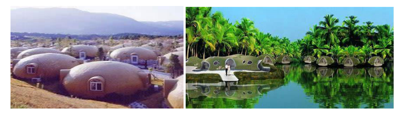
Fig No 5.0 Mud Bnishell, Floating Binishell

Binishells in sustainable architecture and advanced materials enhancing structural integrity and sustainability paving the way for more resilient and eco friendly structures. Integration with digital technologies like 3D printing and robotics promises faster, innovative designs and cost effective building.