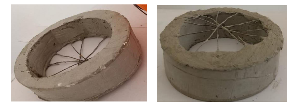
Fig No 7.0 Mini Binishell Foundation Model